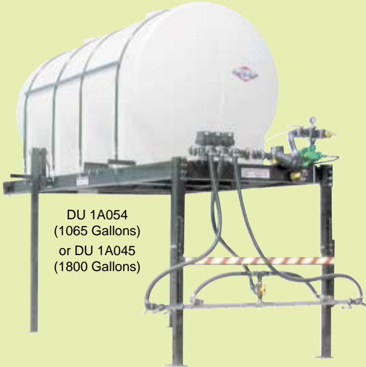
DU 1A054 (1065 Gallons) or DU 1A045 (1800 Gallons)

Shown here with standard stainless boom: sprays 3 sections totaling 35' wide