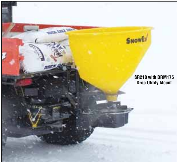
SR210 with DRM175 Drop Utility Mount