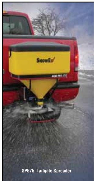
SP575 Tailgate Spreader