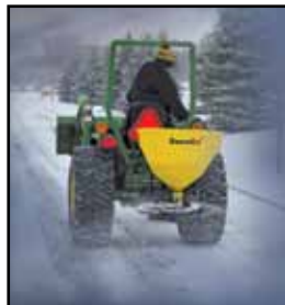
SR110 with TPM175 Mounting Kit

SR210 features an Open Throat design that will handle bagged rock salt.