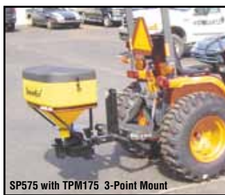
SP575 with TPM175 3-Point Mount