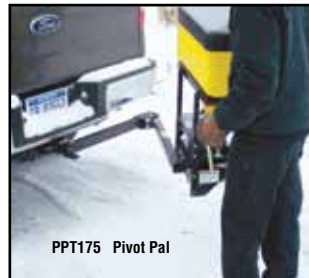
PPT175 Pivot Pal