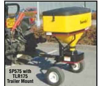
SP575 with TLR175 Trailer Mount