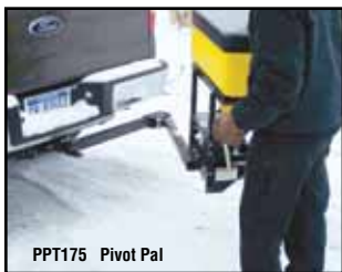
PPT175 Pivot Pal