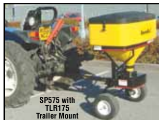
SP575 with TLR175 Trailer Mount