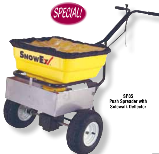
SP85 Push Spreader with Sidewalk Deflector

The ideal choice for spreading salt and ice melters for winter maintenance ice control. Heavy-Duty, Polyethylene hoppers and powder-coated steel frames are designed for corrosion-free performance. Push style walk behind speaders are manually activated. Great design and performance backed by a 2-year warranty.