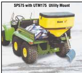
SP575 with UTM175 Utility Mount